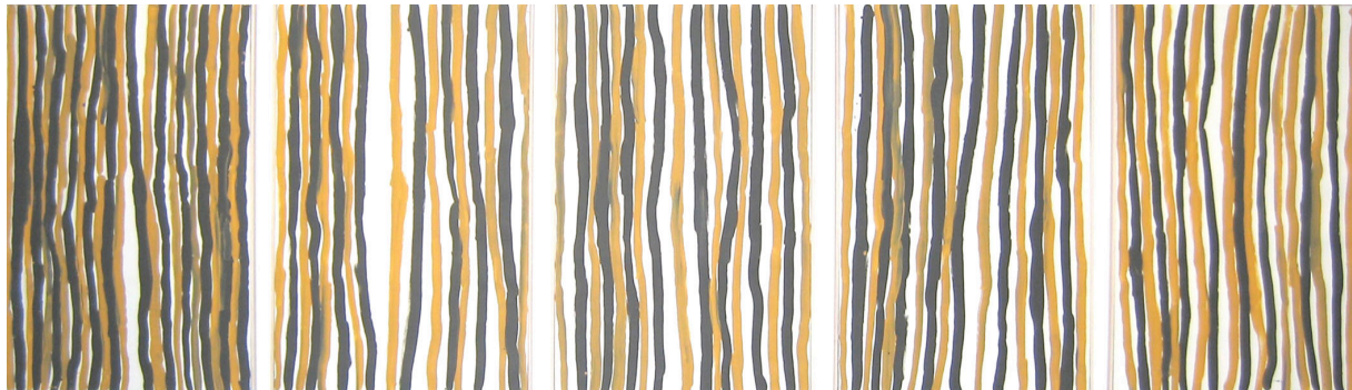
Emily Kame Kngwarreye. Body Stripes,. Acrylic on canvas

As the only gallery in New York with an extensive major collection of Emily's work, and as one of only a few in the US dealing with contemporary Australian Aboriginal art in any substantial way, the Robert Steele Gallery is especially proud to present Emily Kame Kngwarreye .