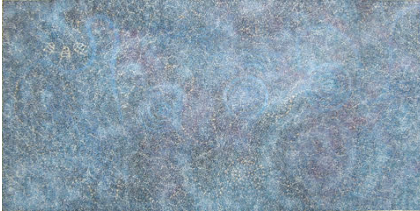
Barbara Weir , Acrylic on canvas.

511 West 25 th Street New York NY 10001 212.243.0165 info@robertsteelegallery.com www.robertsteelegallery.com