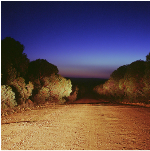
Gretchen Mercedes, Utopia no4, 2001-04.

511 West 25 th Street New York NY 10001 212.243.0165 info@robertsteelegallery.com www.robertsteelegallery.com