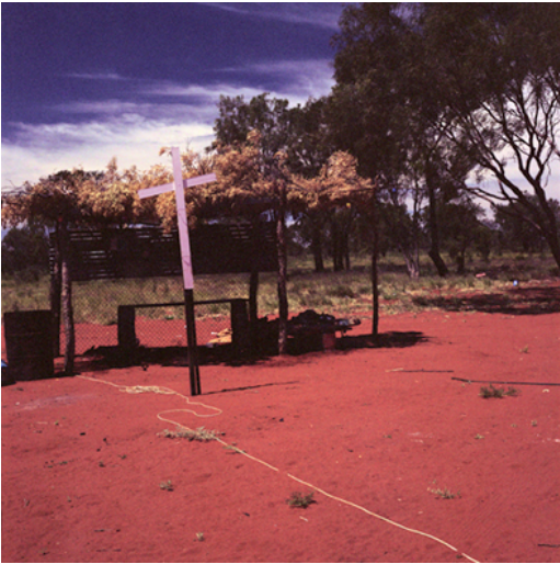
Utopia no.1, 2001-04 Chromogenic print, 29x29in

The Robert Steele Gallery continues in its mission to present work that will engage, provoke and stand up over time. Times such as ours demand an art that can touch the soul.