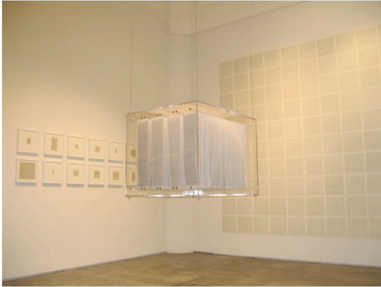
one million dollars, 2007. Installation view.

511 West 25 th Street New York NY 10001 212.243.0165 info@robertsteelegallery.com www.robertsteelegallery.com